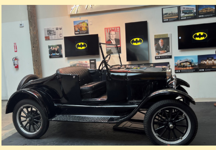
***Designated stop for the Model T sponsorship