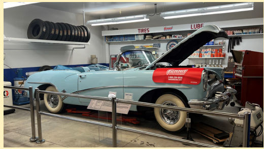
**Garage replica -